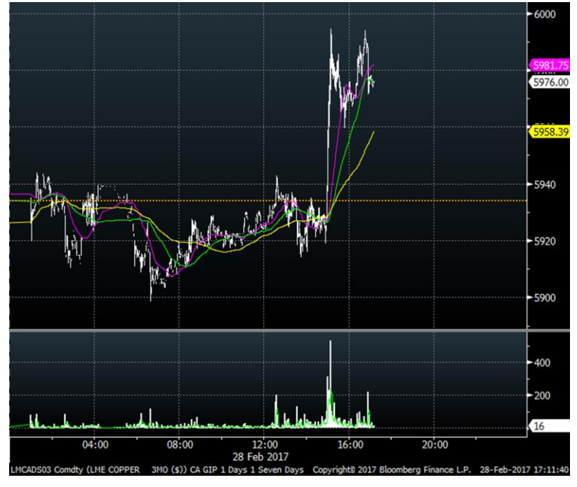
LME Copper 3M chart